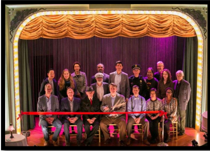
The Speakeasy Ribbon Cutting Ceremony